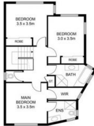
FIRST FLOOR : 64m 2